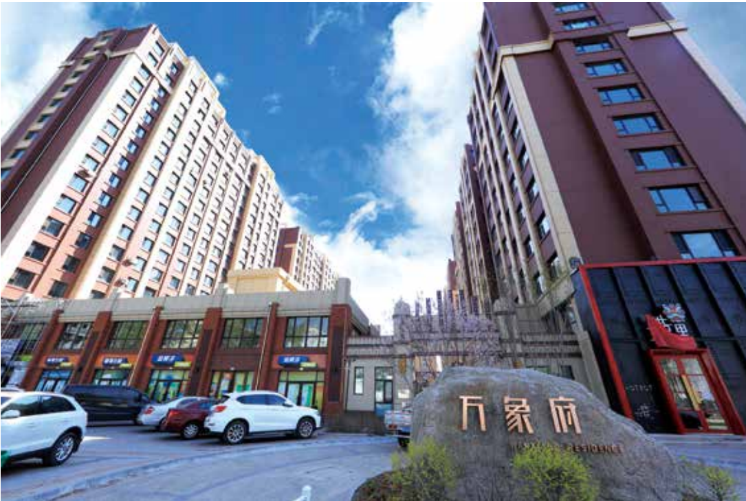
Project Name: Jiamusi Vientiane Mansion Glass Makeup: Tempered + Insulating glass Glass Quantity: 20,000 m 2 Location: Jiamusi, Heilongjiang Province