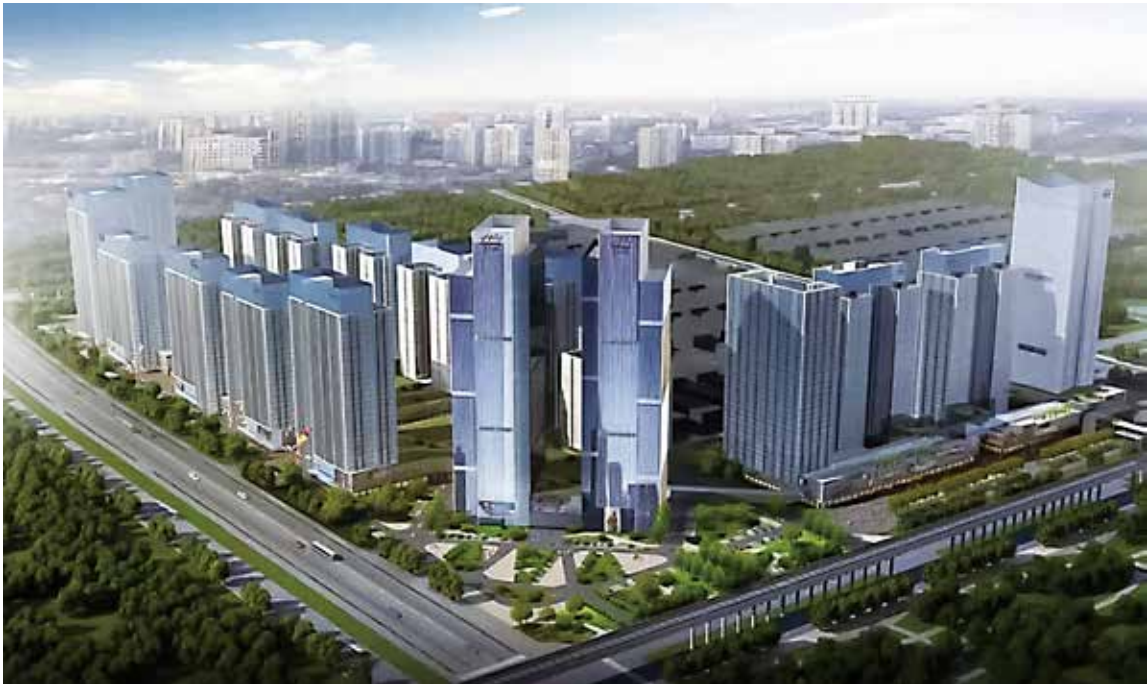
Project Name: 1688 Plaza of Xi'an Huanan Town Glass Makeup: Double tempered Low-E glass + Insulating glass Glass Quantity: 80,000 m 2 Location: Xi'an, Shanxi Province