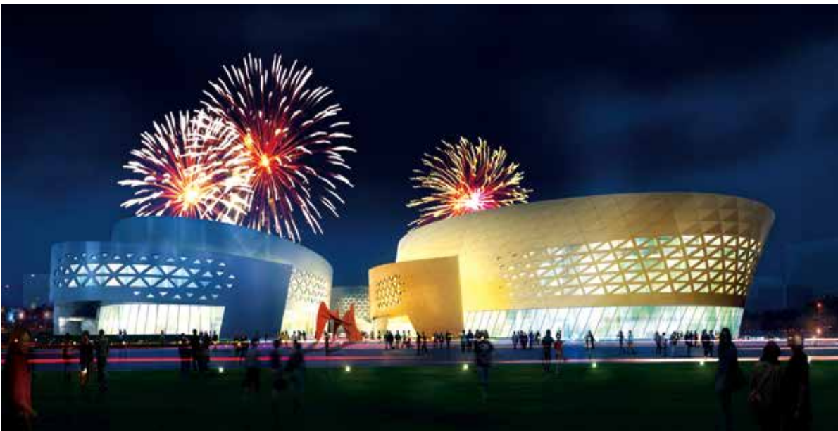
Project Name: Provincial Cultural Center of Tianfu New District Glass Makeup: Ultra clear glass + Insulating glass + laminated glass Glass Quantity: 40,000 m 2 Location: Tianfu New District, Chengdu, Sichuan Province