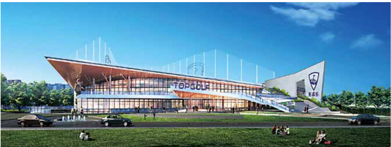
Project Name: Chengdu Tuogle Golf Course Glass Makeup: Ultra clear + Tempered + Insulating glass Glass Quantity: 10,000 m 2 Location: Chengdu, Sichuan province