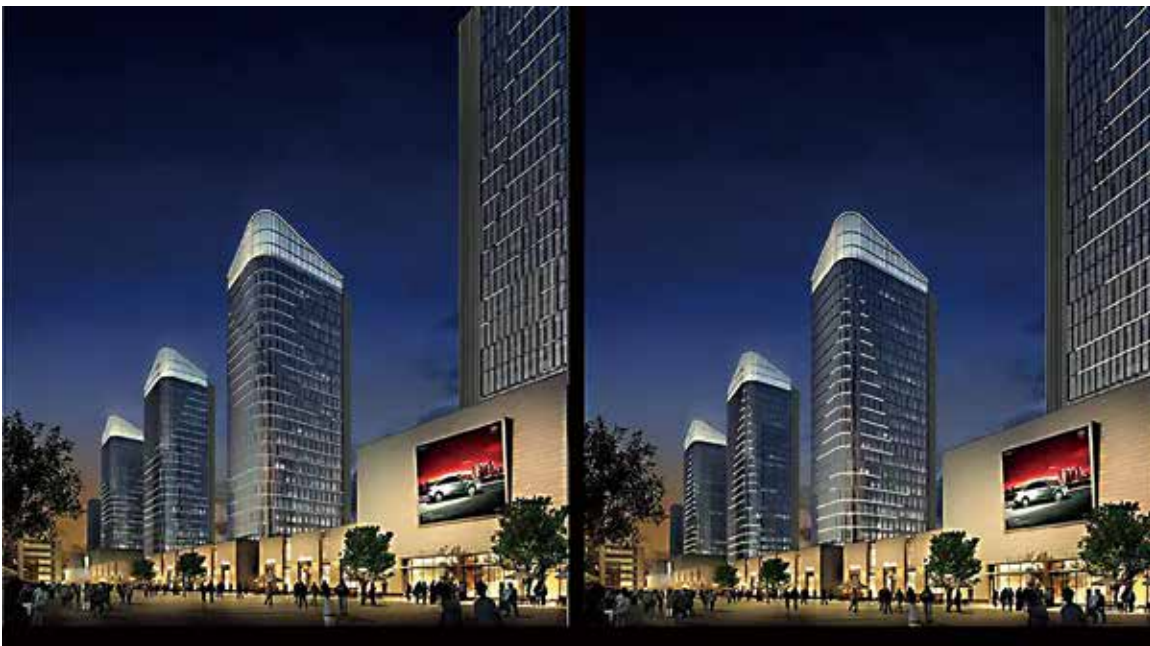
Project Name: Nanjing International Shipping Center Glass Makeup: Ultra clear + Double tempered Low-E + Insulating glass Glass Quantity: 20,000 m 2 Location: Nanjing, Jiangsu Province