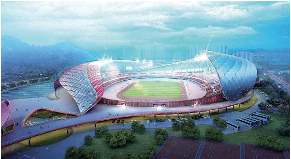
Project Name: Bengbu Olympic Sports Center Glass Makeup: Double tempered + Insulating glass Glass Quantity: 6,000 m 2 Location: Bengbu, Anhui Province